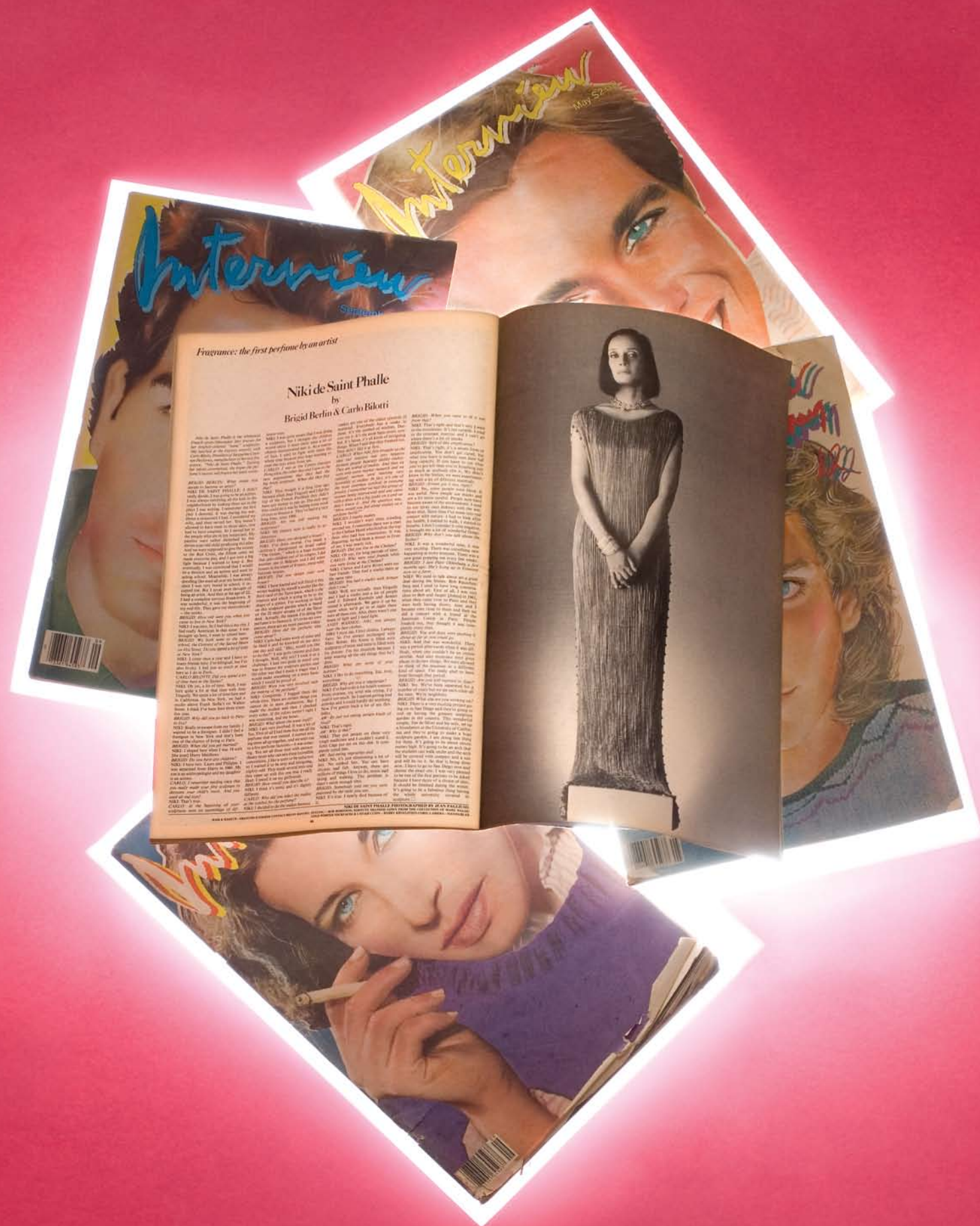
Centre Interview November 1982, spread featuring Niki de Saint Phalle