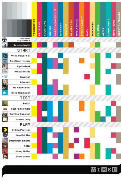
Wired's content as packaged for the digital viewer: the tablet TOC (above); a slideshow (above right); and a long feature (next page).